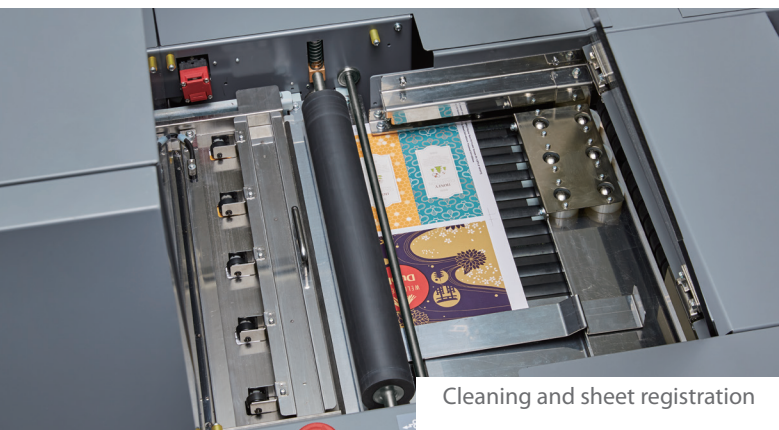
Cleaning and sheet registration