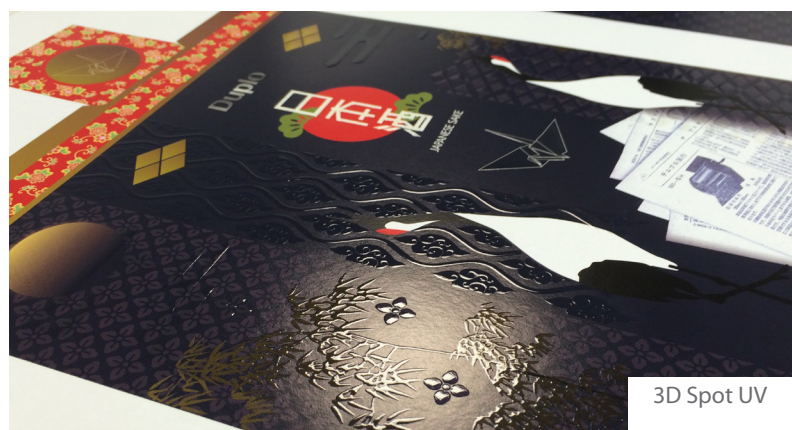
3D Spot UV